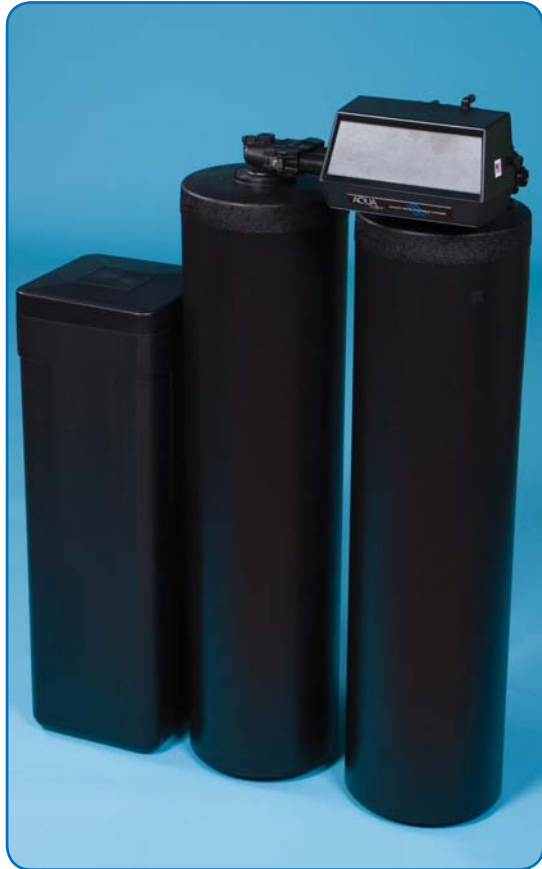
The Series 9100 Twin Water Conditioner with 18x40 Brine System.