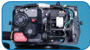
The 9100 Twin Control Valve.