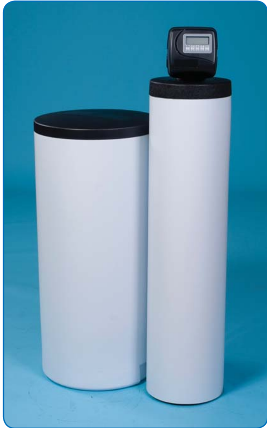
The Series WS1 Water Conditioner with 18x40 Brine System.