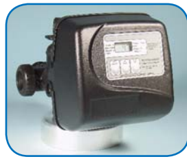
The Series WS1 Control Valve is available in Metered w/ Digital Logic or Timeclock