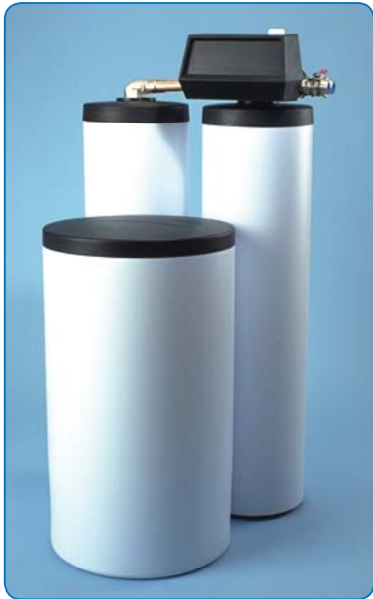
The Series 9000 Twin Water Conditioner with 18x40 Brine System.