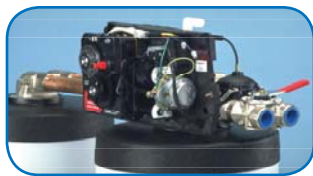
The 9000 Twin Control Valve.