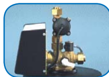
The Series 2510 control, optional by-pass and optional Demand Meter.