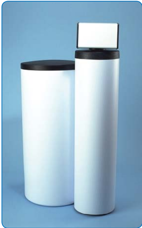
The Series 2510 Water Conditioner with 18x40 Brine System.